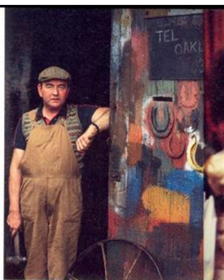
STAGSDEN, ENGLAND.

What best distinguishes nations from the states that claim them is culture and age. States claim sovereignty over a territory in consequence of wars and treaties with other states. Nations claim a cultural homeland on the basis of their development as a people.