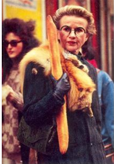
FRANCE. JAMES L. STANFIELD

Fourth World nations . . . comprise ~90% of the world's distinct cultures—1/3 the world's population—and cover 1/2 the Earth's land area. No map, no list, no encyclopedia, no almanac to date has displayed all the world's nations.