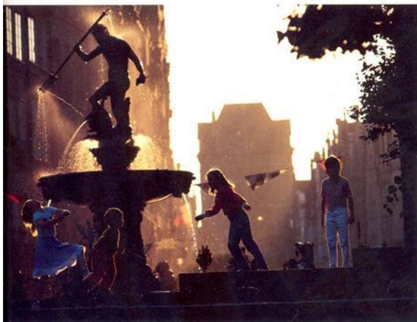
W. POLAND. JAMES L. STANFIELD; MADRID, SPAIN. © L. MAZZATENTA

Fourth World nations . . . comprise ~90% of the world's distinct cultures—1/3 the world's population—and cover 1/2 the Earth's land area. No map, no list, no encyclopedia, no almanac to date has displayed all the world's nations.