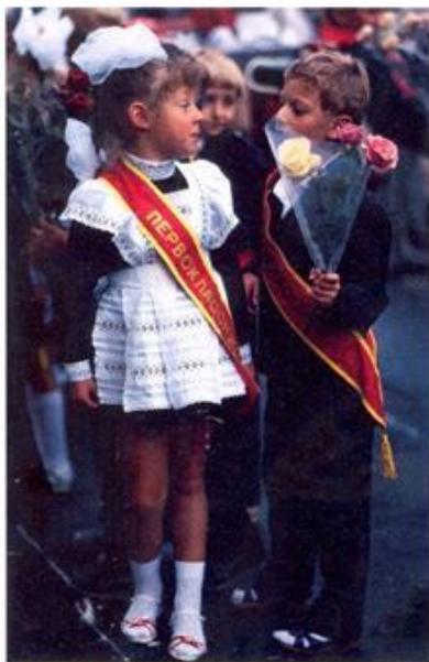
Figure 1. Stepping out for their 1st day of classes, children destined for School 119 in Odessa, Ukraine, carry flowers to their teachers. The sashes of 2 youngsters announce in Russian their status as 1st graders.

The term minority is no more useful. Nationalist claims are not always made by minorities. Bolivia, Guatemala, Peru, Burundi, and South Africa for instance have been ruled by minority